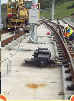
Install Track and Power