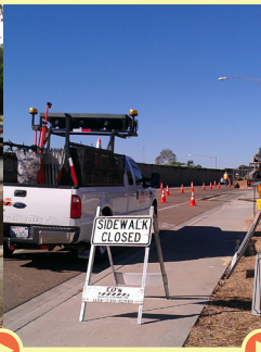
Build Supporting Infrastructure