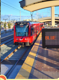
Testing and Start-up