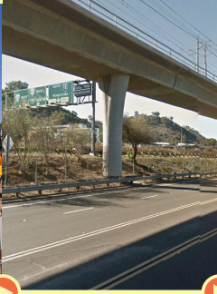
Construct Stations, Bridges and Viaduct